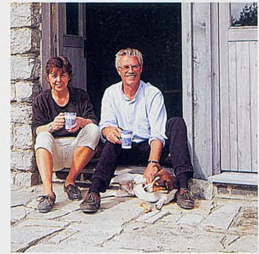
2 The converted barn was previously a cowshed and a milking parlour