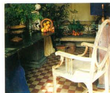
Into the woods, page 114