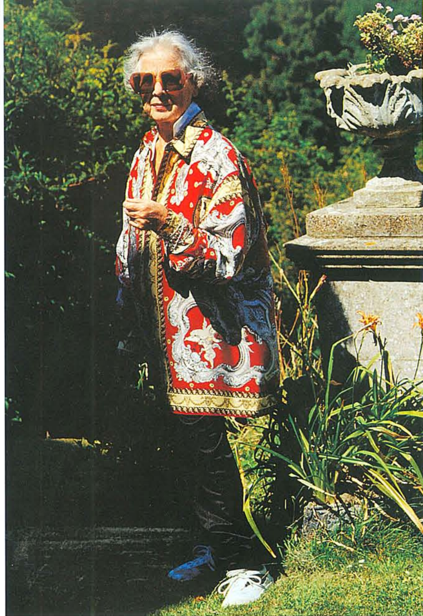
HAIR AND MAKE-UP/RACHEL TURNER AT ARTISTIC LICENCE STOCKISTS/PAGE 160