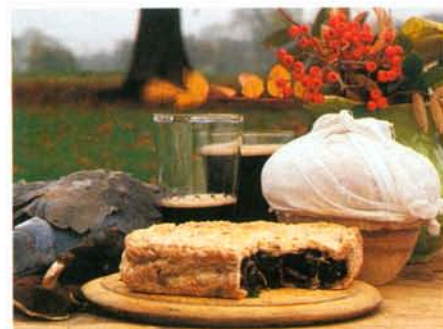
Cook among the pigeons, page 126