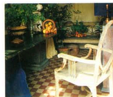
Into the woods, page 114