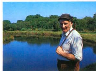
Divine inspiration, page 68