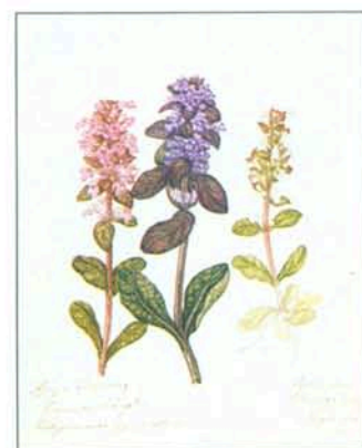
Caroline May, botanophile, page 110