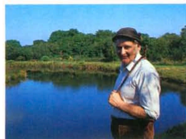
Divine inspiration, page 68