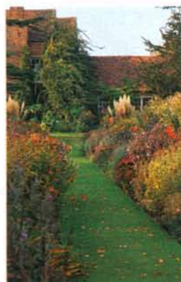
Cover/Simon McBride. Inset/ARDEA