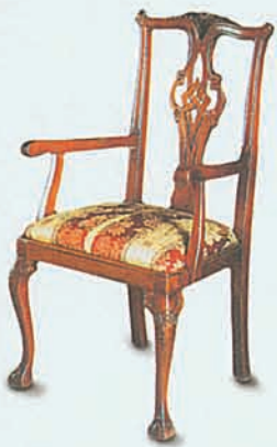
Beechwood dining carver with mahogany finish (PGF 3192), £230 excluding fabric, Paul Grant Furniture (0171-729 1543).