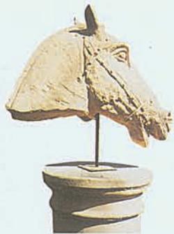
Equine sculpture (C2085), 57cm (22 1/2in) high, £187, Chilstone (01892 740866).