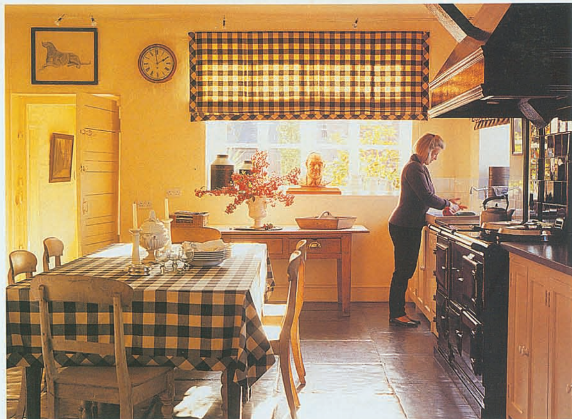
Above To keep the farmhouse character of their home, the Deacons chose a mixture of freestanding furniture and fitted units – which they had made up by a local carpenter. The flagstones are from Classical Flagstones of Bath. Opposite, clockwise from top left The china pantry is a converted lavatory; a collection of creamware fills the shelves; the landing by Elizabeth's bathroom; by the back door is a slit window through which farm workers were handed their wages

1920s Art Deco mirrored splashback (following page), around £150, Walcot Reclamation (01225 444404).