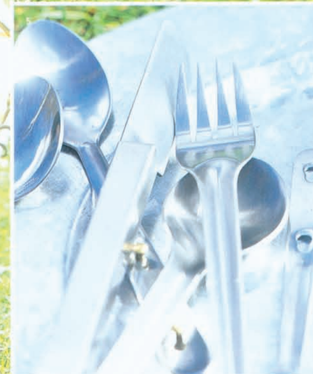
1. Aluminium storm kettle, £33-99, Presents for Men. Churn, £3-95, The Source. Glass, £1-50, Heal's. 2. Table, £135, Andrew Bewick. Metal bowl, from £5, Divertimenti. Metal canister, £5-50, Grand Illusions. Oil dispenser, £14-95 set of two, Divertimenti. 3. Metal basket, £36; glass resealable bottle, £4; tin container in cream, from £8; all Kitchenalia. Checked napkin; beige napkin; both £2-50 each, The Conran Shop. Olive wood cutlery, from £5-99 each piece, Habitat. Bowls, £28 each; glass, £5-95; all The Conran Shop. Clipset camping fork and spoon, £2-99 for single place setting, Emjay Camping Supplies. 4. Metal barbecue, £39-99, Colour Blue. Barbecue turner, £4, Kitchen Ideas. Box of barbecue matches, £2-50; tea towel, £5-50; both Summerill & Bishop. 5. Platter (with matching cloche), £25, Summerill & Bishop. Clipset camping fork and spoon, £2-99 for single place setting, Emjay Camping Supplies. Geometric cutlery (spoon and fork slot into knife handle), around £6-13 for single place setting, The Museum of Modern Art New York Design Store (available by mail order in the UK).