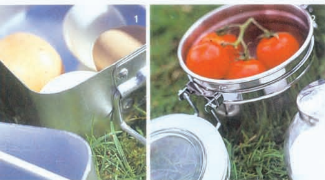
1. Army mess kit, £6-99, Emjay Camping Supplies. 2. Metal container with glass lid, from £9-50, Heal's. Glass jar, £6, Summerill & Bishop. 3. Fold-up metal table, from £70, Pandora's Box. Basket, The Conran Shop. Coffee pot, £85, Summerill & Bishop. Enamel mugs, £3-49 each, YHA Adventure Shops. Hand towel, £48, Jane Sacchi.